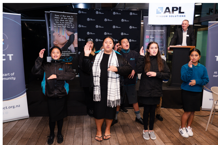
Kapa Haka group at the A Night of Stars celebration from Te Wharekura o Mauao (school)